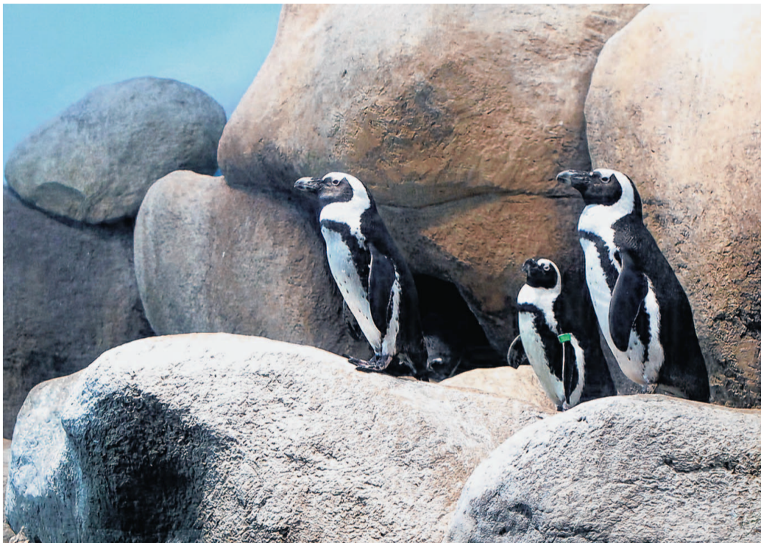
Peter Parker/The Chronicle

The Penguin’s plan to hide among the penguins at the Academy of Sciences exhibit was promptly foiled when Batkid recognized the evildoer’s green armband.